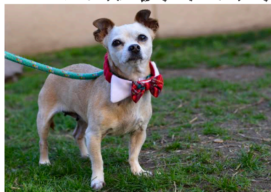
PEANUT,BUTTER 20-02085 8 YEARS OLD CHIHUAHUA MIX FEMALE

AVAILABLE AT THE SPCALA PET ADOPTION CENTER 5026 W. JEFFERSON BLVD. LOS ANGELES, CA 90016 323-730-5302