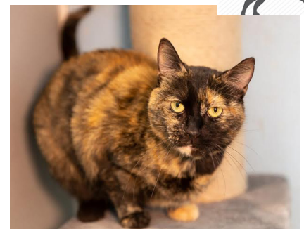
GINGER 20-01972 6 YEARS OLD DOMESTIC SHORT HAIR FEMALE

AVAILABLE AT THE SPCALA PITCHFORD COMPANION ANIMAL VILLAGE & EDUCATION CENTER