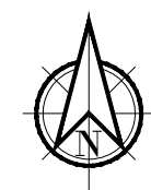
FERN ELEMENTARY - SITE PLAN