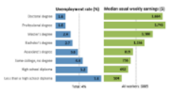
Unemployment rates and earnings by educational attainment, 2016