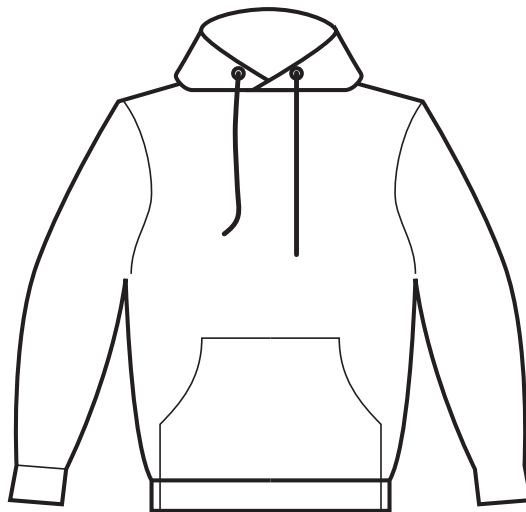
Hooded Pull-over Sweatshirt