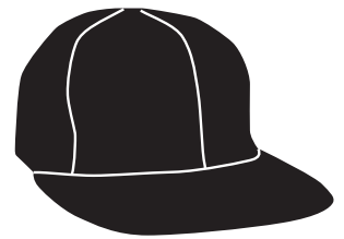
Flat Bill Cap

Small/Medium - 6 7/8 - 7 1/4 Large/X-Large - 7 1/4 - 7 5/8