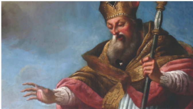
This is a painting of St. Valentine encouraging others to love.

Some people believe that Valentine's day is celebrated in the middle of February to commemorate the anniversary of Valentine's death or burial- which people believe had occurred around A.D. 270- and others claim that the Christian church may have decided to place St. Valentine's feast day in the middle of February in an effort .