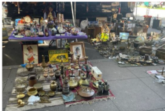
(Multiple different antiques being displayed)

would like to have more space. Finally, when he was asked why he sells what he is selling, he said, "It's just unique stuff... people like them, it depends what people collect, some people collect different stuff." A lot of people collect many different things, whether it is something he sells like antiques, or if it is something more modern.