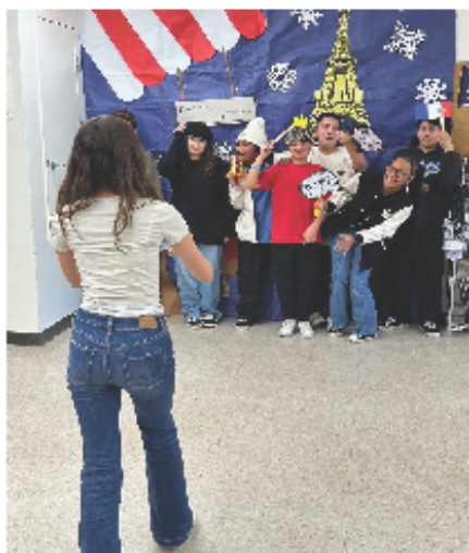
Students taking pictures in the photo room.

Just like every year, the main entrance for the dance was at the small gate behind the Cafeteria, where PTSA volunteers collected the permission papers and gave them three tickets for later use in the Cafeteria. A colorful balloon arch with decorations resembling Paris and France greeted students as they walked in through the gate, revealing the quad decorated with balloons, cardboard light poles, and the newly added photo room made from adjustments in Mr. Pacheco’s room.