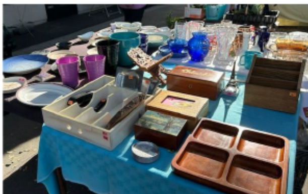
(Different trays and plates being sold)

The Torrance Antique Street Fair came in October 1998 and has been growing ever since. It attracts a lot of people to the downtown part of Los Angeles each month. Shoppers and vendors alike like the laid-back alternative to swap meets.