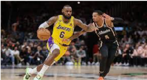
Lebron defending the ball from opposing player

People have mixed thoughts. Some people think it's a positive trade since they think Russell's playstyle is limited because of LeBron and he would fit in the Nets.