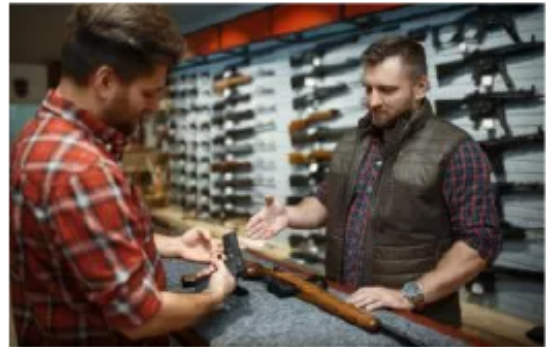
A over the counter transaction at a gun shop being conducted

The second amendment is sort of the reason this is happening right? No, although it may be controversial, it is usually not the reason this happens, we know this because even though you can have a gun due to the second amendment, we still have laws for guns, and lots of them.