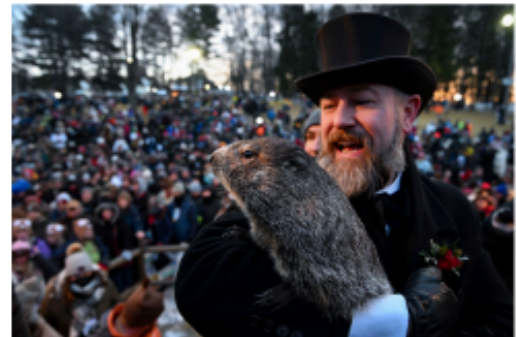
Phil's handler holds him up after he predicted an early spring in 2020.

On February 2nd of every year, millions of people turn on their TVs to watch a groundhog at Gobbler's Knob in Punxsutawney, Pennsylvania coming out of its hibernation. This particular groundhog is better known as Punxsutawney Phil. This strange animal is supposedly able to predict whether or not it will be a continued winter or an early spring. How does it know which one it will be? Well if Phil can see his shadow then it means 6 more weeks of winter and if he doesn't, then spring will come early.