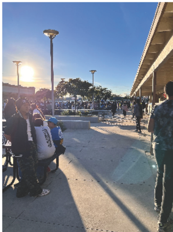
Students hanging out at the quad, with most gathering around the stage with the DJ.

so you could get a combination of a chip, a granola bar, and a drink, or go crazy and get three chips, three drinks, or three granola bars.