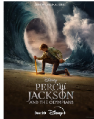
Poster of Percy Jackson and the Olympians

The new Percy Jackson show on Disney Plus is over. The show is much closer to the book. The movies were questionable. The first season was based off of the lighting thief, which was almost fully read, but that's not important.