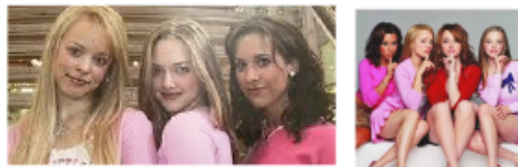
Regina (Rachel McAdams), Gretchen (Lacy Chabert), and Karen (Amanda Seyfried), And Cady (Lindsay Lohan)

In an interview by U.S. news Lindsay Lohan reveals the theme, "In a way, things haven't changed that much, right? People have new ways to mess with each other, right? They can do it over the internet, but it's still just human beings pulling someone else down to make themselves momentarily feel better, right?"