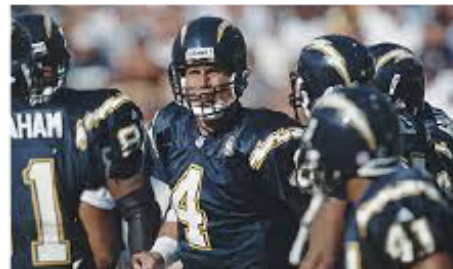
From 1999 to 2000, Harbaugh was the Chargers quarterback (No.4)