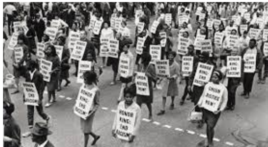
People hold various signs to hopefully convince the government.

After the rejection, people started pressuring the government to make MLK Day a holiday by marching down Pennsylvania Avenue on January 15, 1981, as well as having civil rights marches from 1982 to 1983.