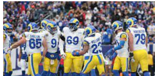
The Rams celebrate getting their spot in the playoffs.

Just 4 days before Christmas, the Rams had another home game against the Saints where they were greeted by Shohei Ohtani on the sideline. They won 22 to 30, their second straight win. On New Year's Eve, the Rams went to East Rutherford, New Jersey to play the Giants at the MetLife Stadium. They won by one point (26 to 25) and secured the sixth seed for the playoffs. Their next game against the 49ers had very little meaning since both teams were automatically going to the playoffs, but the Rams won 21 to 20.