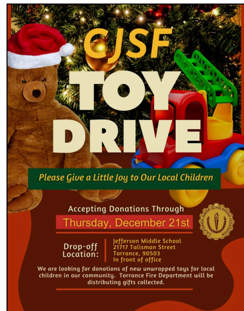
The CJSF & TFD partnered Toy Drive poster.