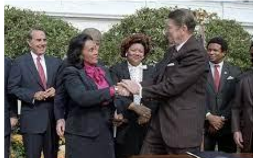
Coretta Scott King shakes hands with President Ronald Reagan after he signed the King Holiday Bill.

Fortunately, it passed the Senate after 2 days of debate and moved on to the president. The King Holiday Bill was officially a federal holiday on November 2, 1983, when President Ronald Reagan signed it.