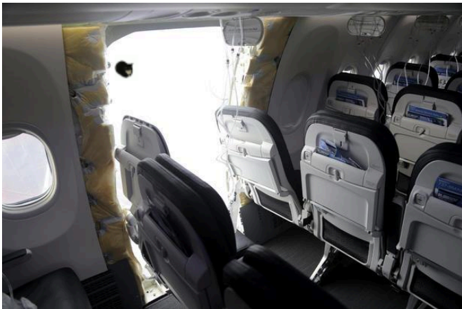
The door plug on Flight 1282 had flown off next to Jack minutes after they started flying.

A total of 171 passengers and six flight attendants, including 3 babies and 4 unaccompanied minors, had boarded the plane at Portland International Airport at 4:52 pm. The first few minutes were okay until a loud boom was heard shortly after they had started flying. A passenger had described it as a very unusually strong breeze, and the plane just filled with air. Jack had been next to the door plug that had blown off and all his stuff like his shirt, his laptop, his phone, and many other belongings had been sucked out of the plane, but luckily his mom, who sat next to him, was there to pull him back in. The flight attendants escorted them to new seats shortly after.