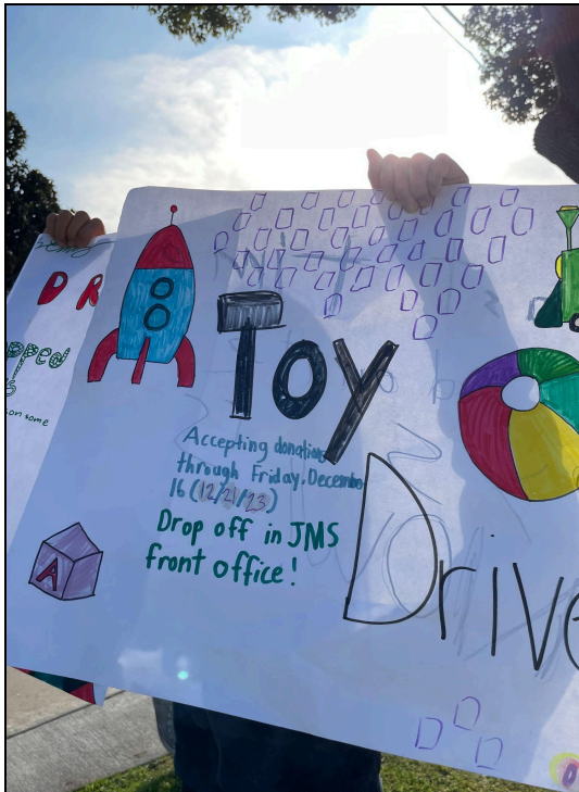
A student holding a toy drive poster