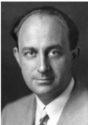
Picture of Enrico Fermi

At first atomic energy was discovered in an experiment with neutrons and uranium by Enrico Fermi. The experiment basically in some way propelled a neutron into a piece of uranium and then split an atom being the first time nuclear fission was done by humans. But there is so much more we can do. We are barely scratching the surface.