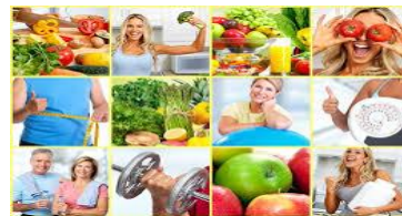
People taking on a healthier lifestyle.

“Get organized, Learn a new skill or hobby...” They’ve also given tips on how to stick with them, “Naturally, your resolution may focus on areas that lack progress, but don’t forget to savor the progress made and find some small way to celebrate.