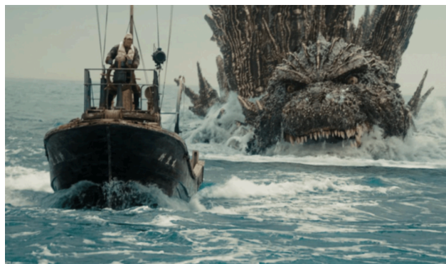
Godzilla attacking boat in Japan

Shin Godzilla was good, probably the most terrifying Godzilla ever, but Toho's newest Godzilla movie, Godzilla minus one, is just perfect. This Godzilla may be the smallest, but he is an absolute menace.