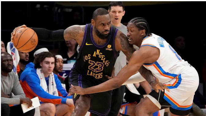
Lebron defending the ball from player from the Oklahoma City Thunders

Some people blame the Lakers performance on their coach. This is because of the Lakers offense relying too much on LeBron James and the Lakers defense relying too much on Anthony Davis. Others blame their defense on injuries. This is because injuries limit their playstyles. LeBron also is mad at his team's playstyle, creating controversy in social media. Recently though, the Lakers figured out their rotation (combination of the players on the court) and have been recently doing decent.