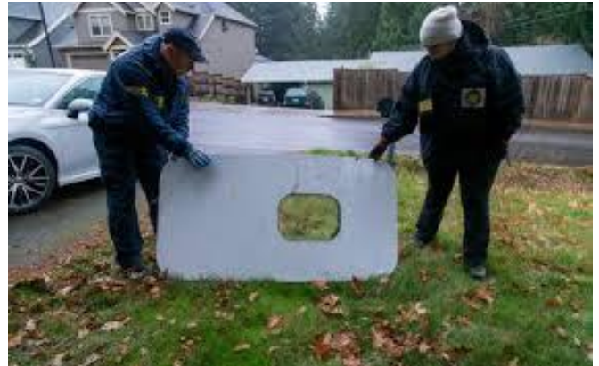
The door plug that fell off in the backyard of a Portland, Oregon-area home on Sunday.

They also found four bolts that were used to keep the door plug in place were unaccounted for, and they don't know if the bolts were there when the plane started flying.