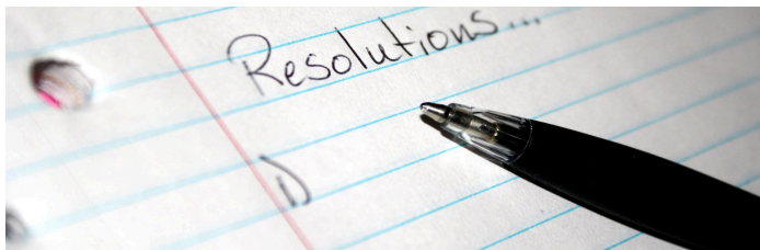
New Year's resolutions.

HAPPY 2024! Welcome back to another exciting year, we hope you all had an amazing time off. Have you ever heard the phrase, “ New Year, New me! ” As the clock strikes 12, New Year’s resolutions have become a tradition for many people around the world. It’s time for reflection and introspection. An opportunity to set goals and make changes. It’s a powerful tool for self improvement and personal growth.