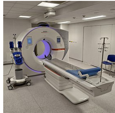
A CT Scanner

We can use atomic energy for medical uses. This is possible because of nuclear medicine. Nuclear medicine is used to see inside the body. This is already in use. They are called CT scans and the machines used look like this.