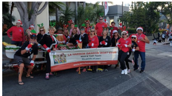
(Dragon Boat Group Photo at the San Pedro Parade)

On December 3rd, there was the 43rd annual San Pedro Holiday Parade.