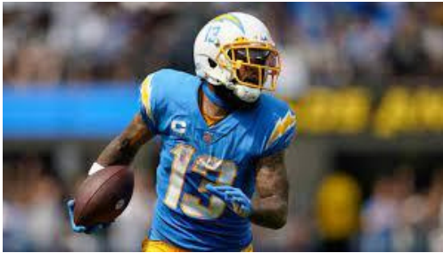
Allen becomes the 54th player in NFL history to reach 10K yards.

Since the last article on the Chargers, the L.A. team has gone against the New York Jets, Detroit Lions, Green Bay Packers, Baltimore Ravens, New England Patriots, Denver Broncos, and the Las Vegas Raiders. On the 6th of November, the Chargers traveled to East Rutherford, New Jersey, to play against the Jets at the MetLife Stadium. During this game, Keenan Allen reached his milestone of 10K receiving yards. The Chargers forced 3 turnovers and were able to win 27 to 6 for their fourth victory this season.