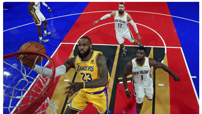
Lebron dunking against the New Orleans

Aside from Anthony and LeBron. The current roster of the Lakers are struggling against the other teams. Their offense is underwhelming and their defense is all over the place. Anthony and LeBron are their main players that are supporting the Lakers the most.