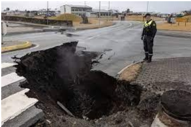
Huge cracks in the ground caused by earthquakes are growing.

Iceland is located on the Mid-Atlantic Ridge, where two tectonic plates, the North American tectonic plate, and the Eurasian tectonic plate, rest. Lately, the boundaries have been moving apart.