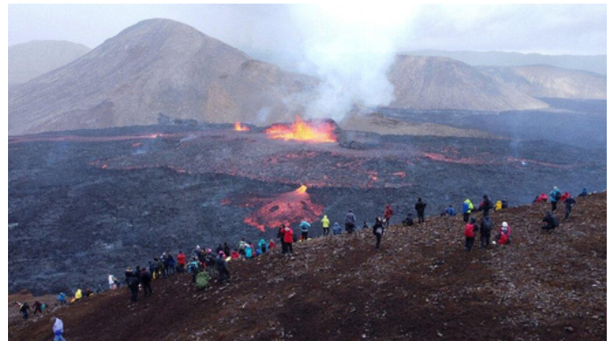
Hundreds of earthquakes are increasing the possibility of a volcanic eruption.

Iceland is known to be a popular tourist destination with two main areas, Blue Lagoon, and Thingvellir National Park, which are always bustling with people.