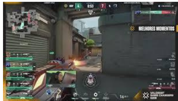
Valorant image, showing what it looks like

Game Changers is a tournament hosted by Riot Games. The tournament even has VCT champions 2023 winners EG.