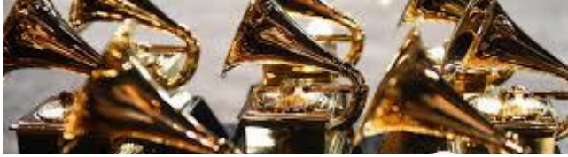
Grammy awards gifted to nominees.

The nominees were announced Friday, Nov 10th. While the host of the show has yet to be announced, some nominations have been released.