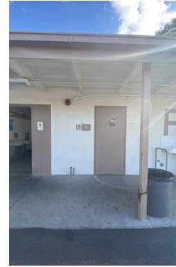
The bathroom that was vandalized

This is probably true considering that recently they had caught whoever kept doing it and now have gone back to the regular bathroom policy. The method does seem to be effective. At first it may not but it didn't last that long.