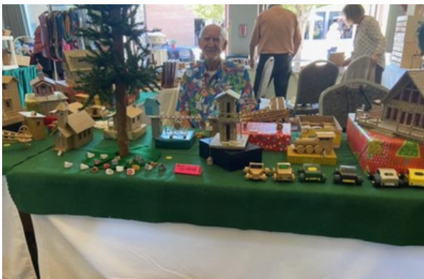
(Man selling his woodworking items)

The event had so many people selling so many different things like pottery, utensils, tiny houses/buildings made of different materials, and so many other things. A lot of people bought many of the different items being sold.