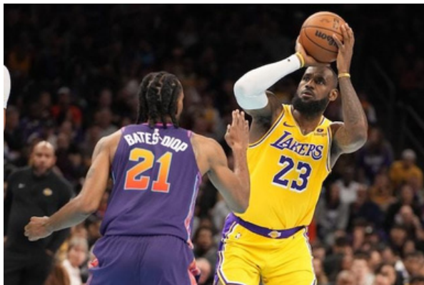
Lebron shooting on a Suns player.

8 teams will advance from group play, which are tournament games, and enter the knockout rounds. Knockout rounds are games that consist of single elimination games and teams that win would move to the neutral site for semifinals and later for the championship. The Lakers are going against the Phoenix Suns on November 10, 2023 and the Trailblazers in their first two games.