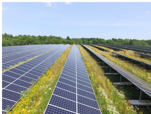
Picture of a Solar Panel Field

Those being the air (wind turbines), water (hydroelectric power), nuclear (nuclear power plants), solar (solar panels), and geothermal (straight from the earth like a hot spring).