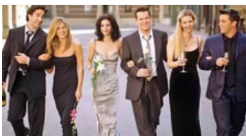
Matthews Co-Stars from the show “Friends”

“In the final years of his life, he wanted to leave a legacy of inspiring and helping other addicts overcome life's most difficult hurdles.”