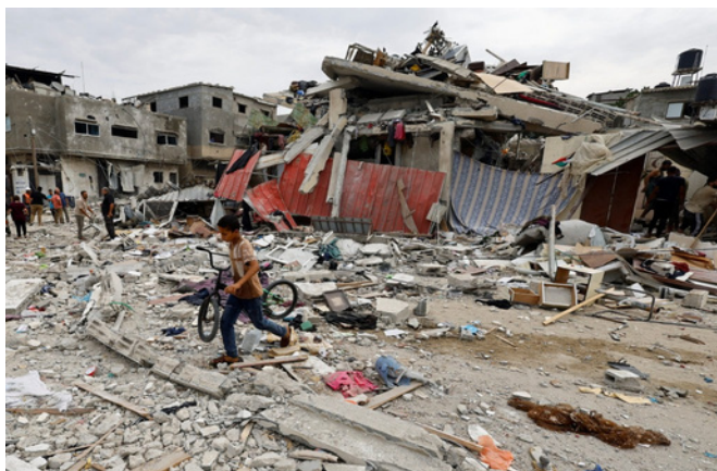
The aftermath of the bombing in Hamas.

Did you know that the Israel and Hamas war is still ongoing? It's been almost a month, and nobody knows for sure who may win. So far, the death toll for Palestinians is at least 10,022, while Israelis are at about 1,400. Nearly 530 Palestinian-owned structures have been destroyed and taken by Israelis already.