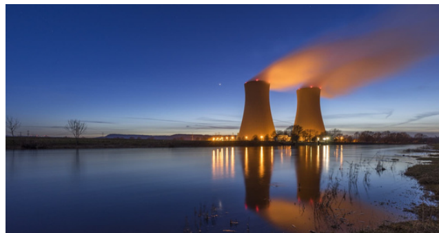
Picture of nuclear power plants

Nuclear energy is probably one of the most powerful, but there are some risks. Big risks. Nuclear energy works through nuclear fission and fusion. Nuclear fusion produces much more energy than nuclear fission. Nuclear fusion works by essentially combining two atoms together, which produces a lot of energy.