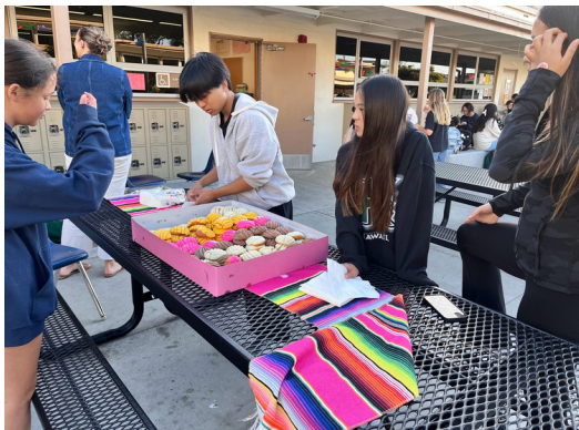
(Student volunteers serving concha bread.)

The taco trucks served— well, of course, tacos, but also quesadillas. On the taco plate were three tacos (chicken, beef, and pork,) with rice and beans on the side, and the quesadilla plate had the same. Plus, volunteers from WHS (West High School) served concha bread, which is a sweet bread roll with crumbly cookie dough.