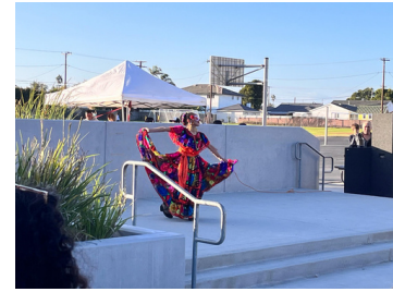
(A traditional dancer performing on the stage.)

Now, enough about food, let’s talk about the traditional dancers! A Mexican dance class offered to perform some of their dances for the Dia De Los Muertos festival at JMS. These traditional dancers wore costumes, went in solos and pairs, and performed beautiful traditional dances for the audience to watch while they munched on their tacos and quesadillas.