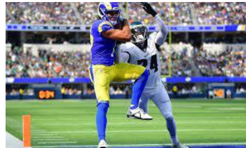
Puka Nacua catches a 22-yard pass for a winning touchdown.

On October 1, 2023, they were up against the Indianapolis Colts. The Colts were able to pull through in the last quarter, evening the score and going to overtime. During the overtime, the Rams were able to score the final point, winning by 6 points.