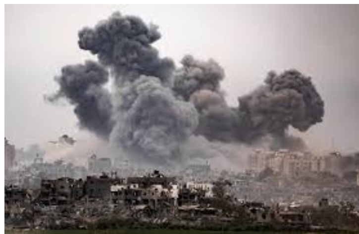
Bombing in Hamas has progressively gotten worse.

“We ran out of medical supplies, we cannot accommodate the high number of victims, and in a few hours time, the generators will come to a stop,” A paramedic had said. “The morgue of the hospital is totally packed. We are keeping the dead in our freezer trucks.” Hamas is low on supplies and protection, yet they refuse to give up.