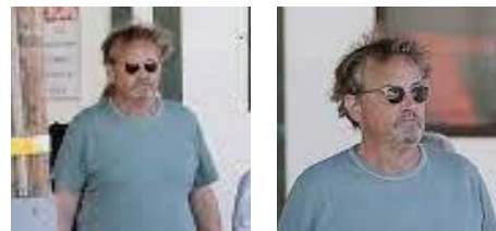
Matthew Perry six days before he died

“We drove out to swim in creeks... kissed in a field of long grass,” she wrote. “It was a magical summer. He had shot the pilot of Friends but it had not aired yet. He was nervous, hoping his big break was just around the corner.”