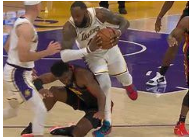
During the Lakers first preseason game, LeBron sat out.

through and continued to stay at the top for the majority of the game. With still a little more than a minute left in the game, the Nets were winning by 1 point again, but the Lakers were able to make 4 more points before the game ended, making the win by 3 extra points.