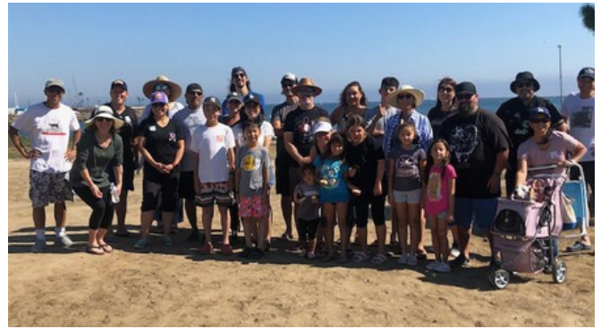
(Half of L.A. Harbor Dragon Boat Open House Participants)