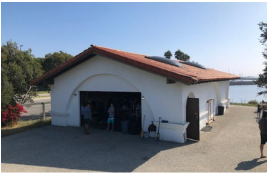
(L.A. Harbor Boat House)

Do you know what Dragon Boating is? You probably don't, but dragon boat is a big event in China with races, events, and traditional foods such as eating Zonghi (glutinous savory fillings in bamboo leaves). In San Pedro, there was a small gathering with the L.A. Harbor Dragon Boat Club that had food and games, such as bean bag tossing. People at the event even got to participate in dragon boating by going out on the water. They had to paddle out not too far in the ocean.