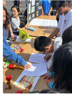
Students signing up for a club.

What type of clubs are there? Well, the common themes of clubs could be art, dungeons and dragons,