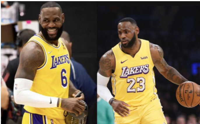
LeBron officially switched numbers on July 16th, 2023.

For the upcoming season, LeBron James has changed his jersey number from 6, back to 23. This is to honor Bill Russell who passed away in July 2022. Even though the number 6 has been retired, those who are currently wearing it may continue to do so, but it can't be issued again.