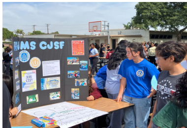
Club leader explaining their CJSF club.

How does it work? In early Fall, every year the JMS office hands out forms for students to create their clubs. These clubs have students as club leaders, and teachers of their own choice as the supervisors. They attend a meeting for club leaders and choose which days their clubs will do activities, so a club is made. All student clubs are during lunch and have chosen days of the week for the club members to attend (Monday-Friday). Then, club leaders create fliers on the Jefferson bulletin board, in classrooms, and more.