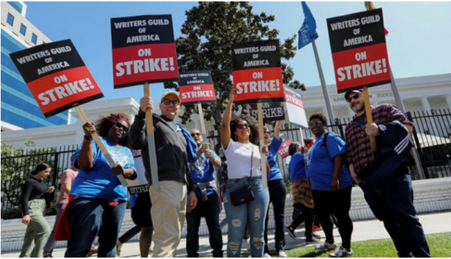
People protesting for the writers strike.

Recently there was a Writers Strike going on that meant that there will be a lack of movies and games as with no writers there will be no stories and this is because movie and game writers alike are overworked and underpaid because they work for a company who has them almost constantly writing stories with no breaks.