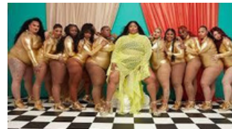
Lizzo and her backup dancers.

With all the mistreatment of the staff and dancers, one would think that someone on Lizzo’s management team was sure to come forward and confront her. Well no, People states that, “her management staff sees as condoning such behavior,” so it continues unchecked. Lizzo certainly knows what’s going on but is choosing not to put an end to this.”