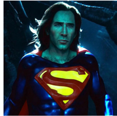
CGI from the Flash movie

For example, in the Flash movie it is no doubt that a lot of the CGI is janky. The movie's budget was 300 million dollars. Lots of work room right? Surely they had enough money to have all the right technology for the CGI, and they did, yet it looks like this.