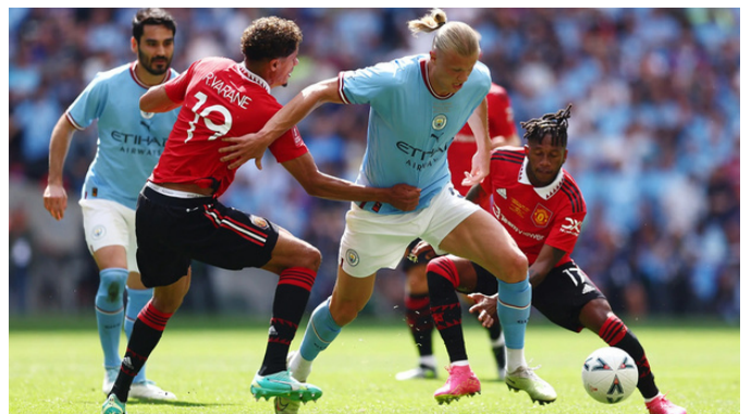
-An image of the Manchester City Vs. Manchester United game.

While Arsenal and Liverpool are runner-ups with a 13% chance.