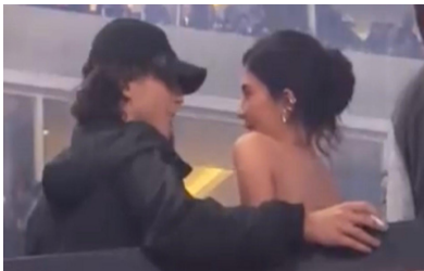
Kylie and Tim before showing affection.

For context Kylie and Timothée have had rumors circulating about their relationship for some time. For as early as april, rumors sparked with cosmetics star and award winning actress. Before this, Kylie had been with Travis Scott, A famous rapper and singer. Meanwhile, Timothée's recent alleged relationship had been with Taylor Russell in November 2022 before Jenner and chalamet had officially come out as a couple.