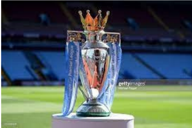
-An image of the Premier League Trophy, winning would be crowned England champion.

BOOM! The premier league has officially started. Teams have started off strong with Manchester city in the lead with 12 points. While Tottenham and Liverpool are right behind Manchester City with 10 points. And in deadlast there are Burnley, Luton Town, and Everton. Burnley and Luton Town with 0 points and Everton with 1.