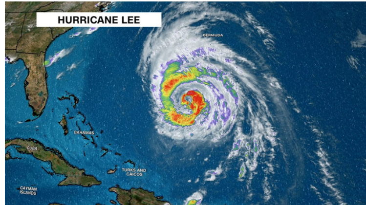
Hurricane Lee's form before it reached Florida.

Because the rising sea temperatures caused by climate change are making hurricanes much more frequent and powerful than before. In the last 42 years, the sea temperature has risen by a large amount. Over this past year, we had 5 hurricanes; hurricane Hilary, hurricane Lee, hurricane Eian, hurricane Margaret, and hurricane Jova. This can be a huge threat to animals as it causes sea levels to rise, causing floods, strong and fast wind speeds, beach erosions and much more harmful disasters to animals.