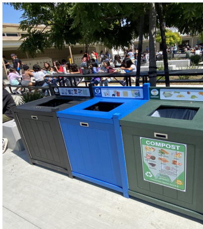
Sorting Stations in the Quad

Ms. Nunes says, "We have plenty of trash bins, we have sorting stations available to make sure that we leave all the trash in an area that we eat, also avoids us from if trash is left behind, we have little critters, like squirrels that are round the campus..."