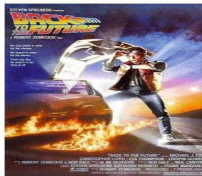
Back to the Future poster.

Anyway, my personal favorite part and a little detail that I noticed was when Marty went back to the future and came back to Twin Pine Mall. This is because when he went back to 1955 he ran over one of the trees with the DeLorean that belonged to the owner of Twin Pine Mall. All of the actors put on an amazing performance. I am a fellow nerd so I know a lot about all of this. The DeLorean is also just something many people can recognize instantly.