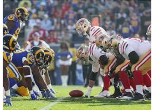
An image of the 49ers vs the Rams

During an interview with Aaron Donald, he states “Did some good things, did some bad things”, in the future Aaron Donald doesn't care if they win games or not, but if their team is improving and doing good things. Aaron Donald says this after losing to the 49ers.