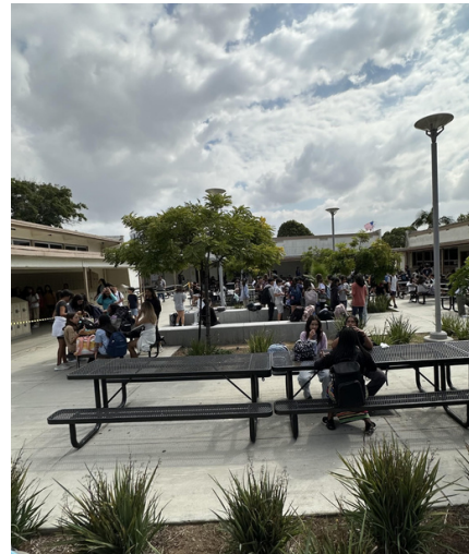
People Eating in the Quad