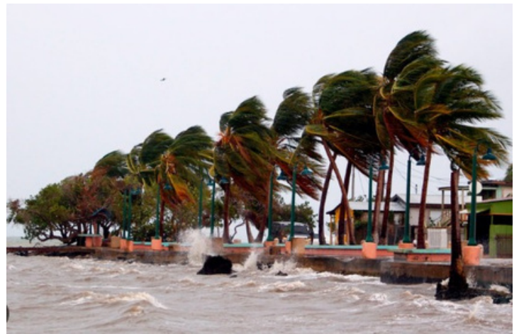
Flood caused by hurricane.

The total cost of just 2023 alone from hurricanes was estimated at $32.7 billion so far, while the average cost of hurricanes are about $165 billion. It is also shown that hurricanes are much more dangerous and destructive than tornadoes and tsunamis.