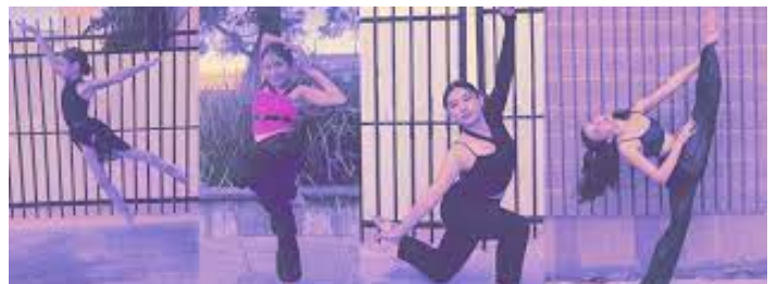
RKDC facebook photoshoot

“Our mission is to make sound dance training and performance accessible and affordable, nurture a staff of excellent teaching artists and bring young people together through joy and movement in a non-competitive environment!”