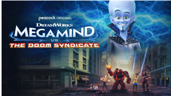
Megamind Vs The Doom Syndicate ugly poster

It is with the deepest of regret that I have to say this about one of my childhood favorite movie characters, of all time, but... THE MEGAMIND SEQUEL SUCKS! I did not wait 14 years for this pathetic excuse for a sequel.