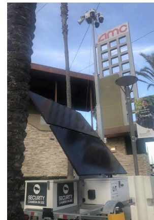
(New security camera device)