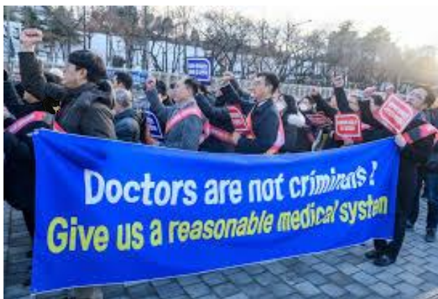
Doctors in South Korea refused to work because of underpayment and overworking jobs.

The doctor-to-patient ratio of 2.6 per 1,000 people is one of the lowest among developed countries, according to data from the Organisation of Economic Cooperation and Development (OECD) countries. In contrast, top ranked Austria has 5.5 doctors per 1,000 people.