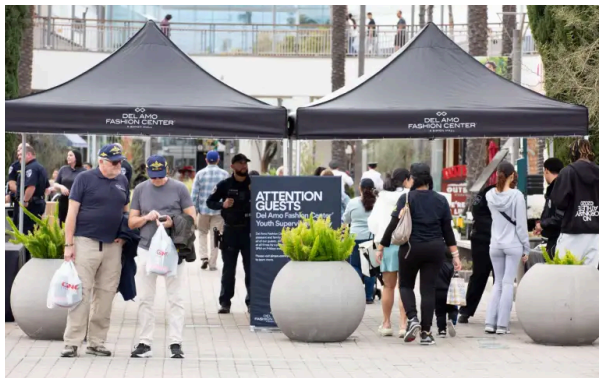
(New Checkpoint at Del Amo Mall Entrance)