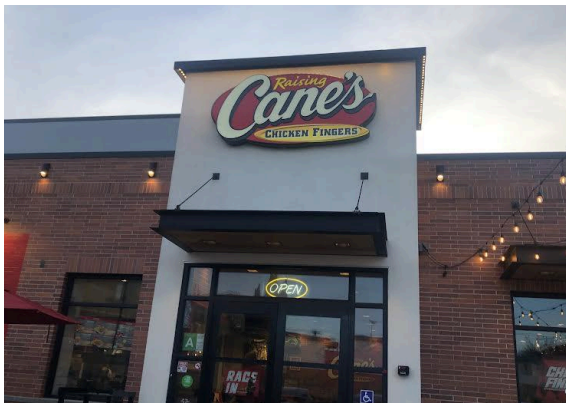
(Raising Cane's Restaurant)

What is your favorite special activity that the school provides? Is it something history related like Greek Day or Renaissance Day? Or is it a special field trip like Camp Pali or Astro Camp? All of these special activities cost money, and in order to get that money, the school needs to fundraise.