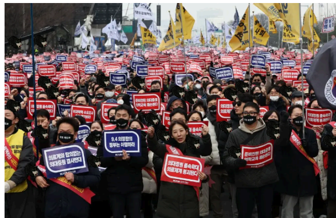
The doctors are determined to get a better medical system.

One of the trainee doctors involved in the dispute had reportedly said he worked over one hundred hours a week at a top university hospital for two million won (about $3,000) a month, even including overtime pay.