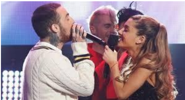
Ariana Grande with Mac Miller

Moving forward, Mac Miller and Ariana hit it off in 2016 to 2018. This is by far one of Ariana's most memorable relationships for the public. They dated for two years, although Ariana admitted he wasn't perfect she does say "He didn't deserve the demons he had." After Mac Miller's death, Ariana went on to write the song "thank you next" as a tribute to him. In the lyrics she wrote "Wish I could say, 'Thank You' to Malcom / 'Cause he was an angel."