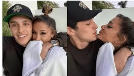
Ariana G. and Dalton G. before divorce

Fast forward a few years, in 2021 Dalton Gomez and Ariana got engaged after dating for some time in May of 2021. Us Magazine says "It was tiny and intimate — less than 20 people," her rep told Us . "The room was so happy and full of love. The couple and both families couldn't be happier." Their happiness didn't last long as they got divorced in July 2023 "A source exclusively told Us at the time that the estranged couple had "been having some issues for months now" and initially split in January 2023. In September 2023, Grande officially filed for divorce."