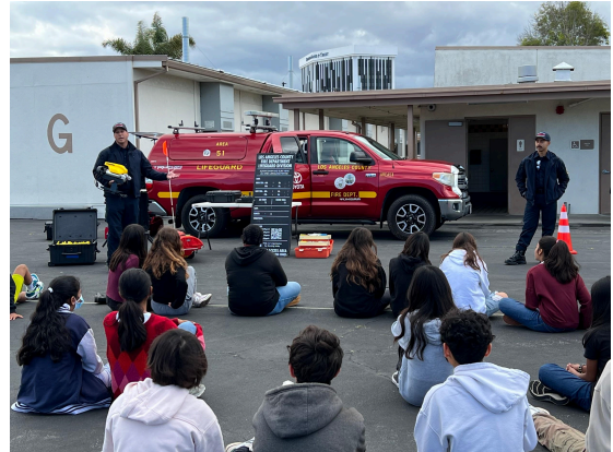
(Lifeguards from last year's Career Day)