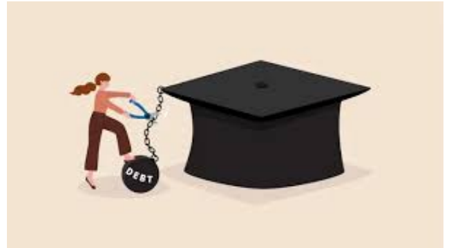
A Picture Symbolizing how College Debt Holds People back from Succeeding in Life

Around 43 million Americans have student loan debt. And having student loan debt can keep people from progressing in life. For example, it can keep them from getting a house, and many more things. People can't try to buy things in life and try to, maybe invest in companies, and make more money if their college debt is holding them back.